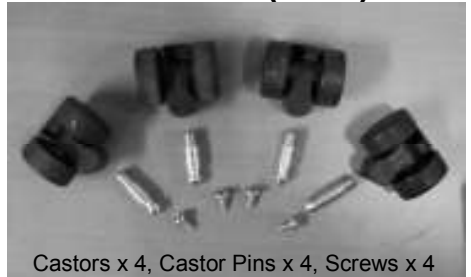
Items you should receive with your 'Castor Base' & Instruction Leaflet.

The castor base will add approximately 20mm to the height of the cabinet.