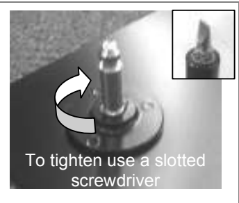
The castor pins screw-in clockwise to fit.

The castor base will add approximately 20mm to the height of the cabinet.