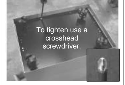
Tighten screws using a crosshead screwdriver.

(For A4 (CB2) & A3 (CB3) Multi-drawer Castor Base fittings see Guide 17) Please beware sharp edges inside cabinet