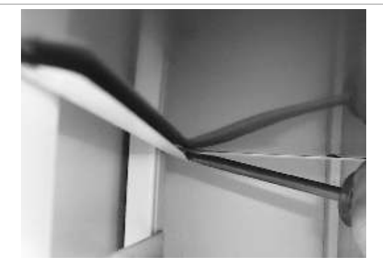
To release the drawer from below: Place a screwdriver between the runner & underside of drawer front, and lever the runner downwards. (Repeat both sides)

Once the runner has been bent up, or down sufficentlyyou should be able to release the drawer.